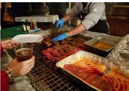
Left: Steaks cooked to order! Cooked to perfection by Texas Roadhouse at the pit at the ISV Town Hall Pavilion.