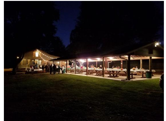
Guests arriving for celebration.

Tonight the town celebrated 27 years. Old friends and new gathered to reminisce about the past and to look forward to the future. If the first 27 years has shown us anything, it's that the next 27 should be just as awesome!