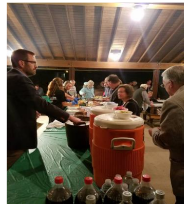
Friends and neighbors reminisce as they wait for the festivities to begin!