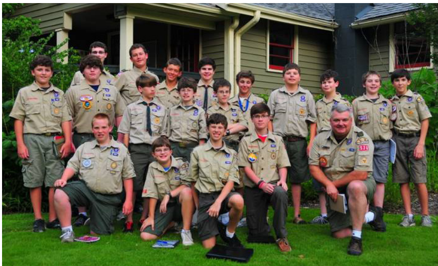
BSA Scout Troop 538 from Asbury Methodist Church

The simplest way to not encourage predators is to not be a source of food for neighborhood pets. Never leave food out overnight. Other animals may feed on that food and coyotes will go after them. And then, the same coyotes will come back over and over looking for four-legged meals. The next time, your pet could be that meal. Predators usually don't stay where they can't find food.