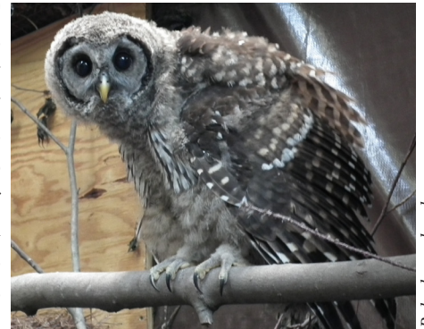
Baby barred owl

6/1/11 – 10/31/11? (Approximate date, depending on Mother Nature): Continuation of Baby Season at the Alabama Wildlife Center. Every day, from 9:00 a.m.-5:00 p.m., visitors can observe the care of Alabama native wild bird patients in the nurseries, solarium and raptor flight cages through one-way glass viewing windows. One never knows from day to day who the patients will be. So far, we have received over 350 baby songbirds and over 30 baby raptors. Our baby bird nursery is almost at 100% capacity. Consider 25 baby birds with scheduled feedings every 20 minutes and over 50 with scheduled feedings every hour, all for 12 hours each day.