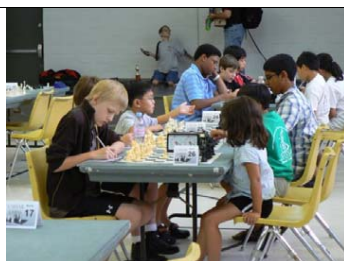
2010 Birmingham Classic Let’s Play Chess... Metro Birmingham Area Kids