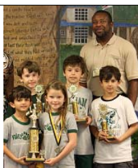
2010 Pushing Pawns Scholastic K-4 Team Valley Intermediate Kids