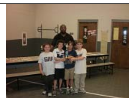
2010 Pushing Pawns Scholastic K-8 Team Oak Mtn Intermediate Kids

Classes * Excitement * Friends * Competition * Tournaments * Winners