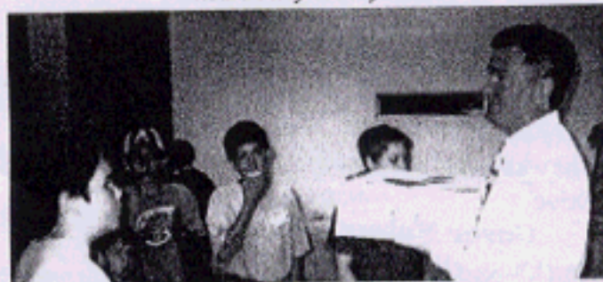
Many of the students had questions