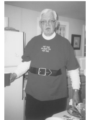
Holiday Gathering following December 20th Town Council Meeting. There was an amazing selection of delicious things to eat.