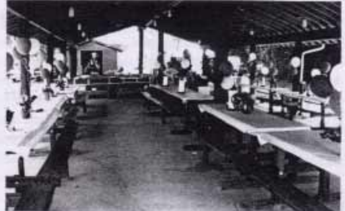
The pavilion is readied for hungry Villagers.