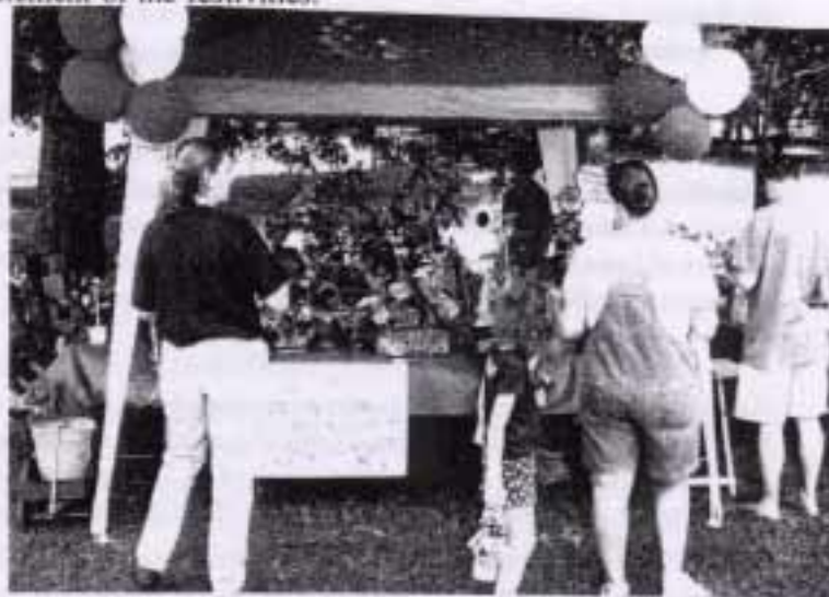
The ISV Garden Club holds a special sale with a special mascot (below)

For the second year, the ISV July 4th Celebration has been blessed with a special plant sale held by the ISV Garden Club . This year the "flowery fare" was indeed a welcome element of the festivities.