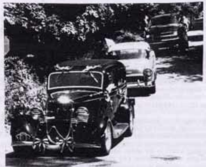
The parade winds down Indian Crest Drive on the way to the town hall.

Parade registration and coordination was handled by yours truly. As in the past, eager parade participants began assembling in the parking lot of the Winn-Dixie Marketplace on Valleydale Road long before 10:00 a.m. All were happily preparing for the annual parade through the Village. At 10:35 a.m., participants filed onto the streets of ISV.